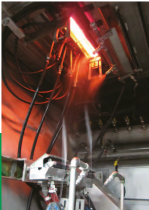
Glass fiber is being produced at a furnace product line powered by oxy-fuel

Oxy-fuel is a proven technology that can significantly cut NOx emissions while delivering further production and efficiency benefits and is an effective solution to help Chinese glass makers succeed in the challenging marketplace. A leader in oxy-fuel technology with over 50 years of experience and a proven track record, Air Products offers an integrated oxy-fuel solution comprising gas supply to oxy-fuel burners and technology, a customized control system, technical and design expertise, commissioning service, safety and site training, maintenance contracts and project management. It also allows flexibility and enhanced security through equipment purchase or lease options and multiple gas supply modes. At the heart of this integrated solution are Air Products' glass experts and their vast experience and technical know-how.