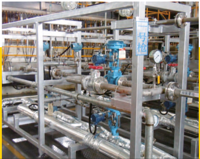
Adjustable oxygen flow control skid