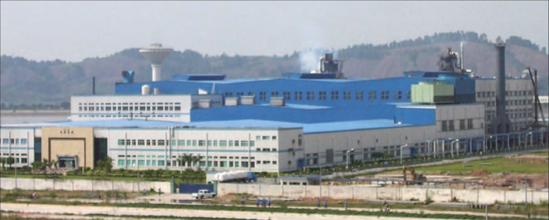
Bird's eye view of Chung Shun Century's plant

In just 6 months, a leading fiberglass manufacturer in China successfully reduced NOx emissions by 80% in its production process to meet the government's environmental regulations for Asian Games 2010 as well as contributing to building a greener community by converting from air-fuel to Air Products' integrated oxy-fuel solution. The conversion brought no interruption to daily operations but delivered long-term economic and production benefits.