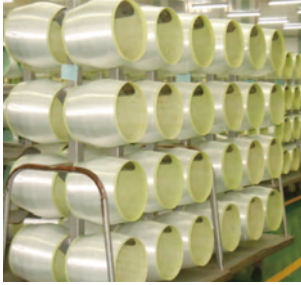
Alkali-free fiberglass produced by Chung Shun Century's Oxy-fuel furnaces

China ranks first in the world for glass both in terms of production and consumption. According to some statistics, the number of glass manufacturers in the China market had already exceeded 20,000. Traditionally labeled as a high energy consumption industry, glass production also produces nitrogen oxide (NO x ) emissions—a contributor to smog and acid rain.